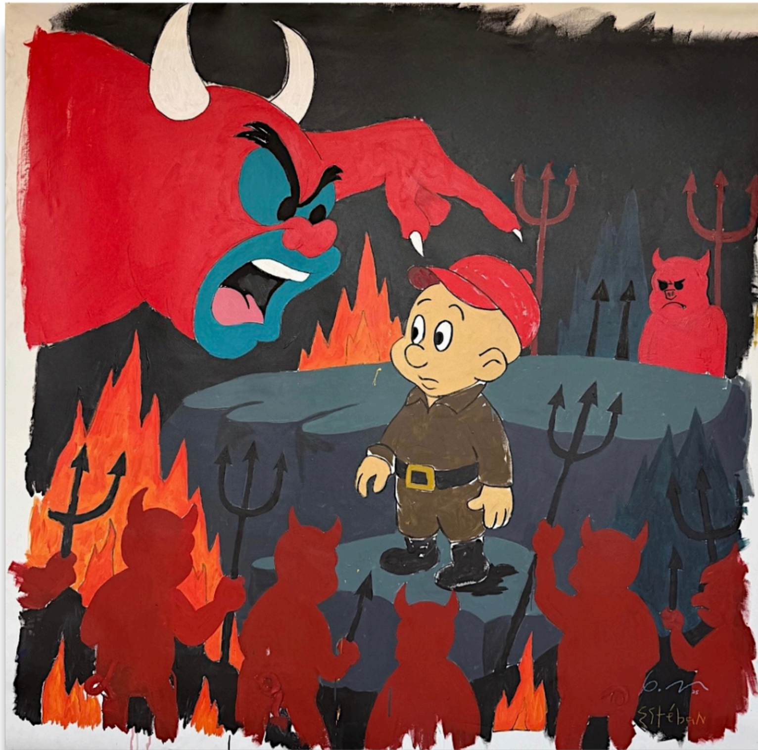
Everyone Talmhout Heaven, Aint Goin' Series: Amerikkka's Looney Acrylic and Oil Stick on Unstretched Canvas Signed on Back 74" x 74" $14,000 2025