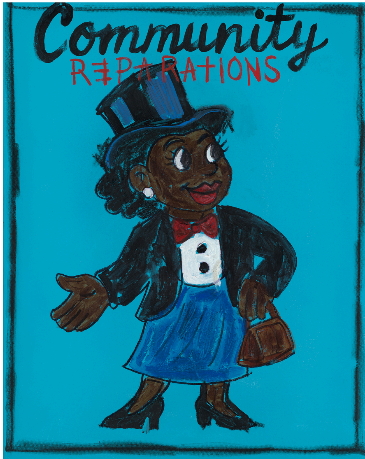
Community Reparations II (3 of 4) Series: The Monopoly of Gentrification Acrylic and Oil Stick on Canvas Signed on Back 24" x 30" $6,000 2025