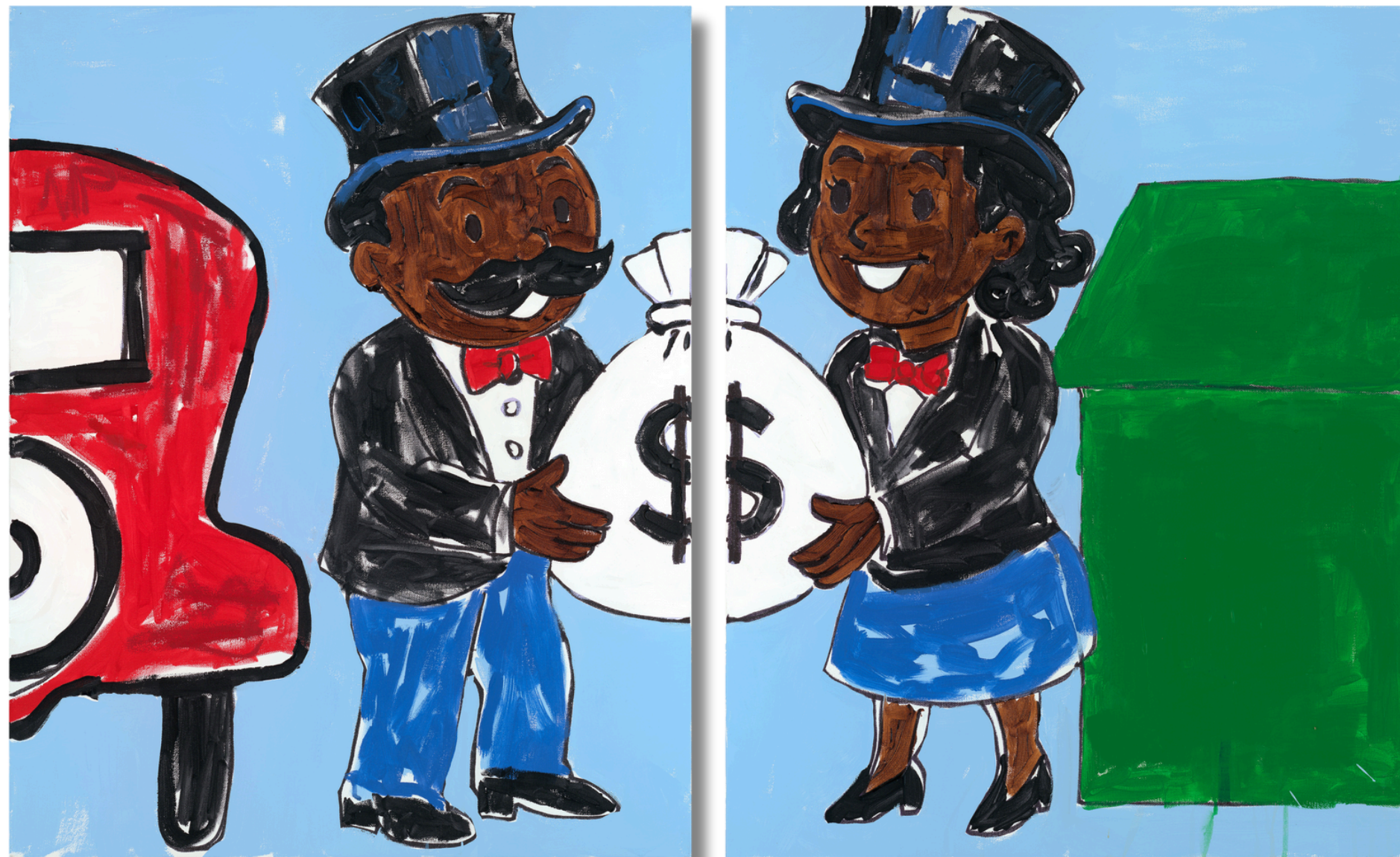
Better Together (Set of 2) Series: The Monopoly of Gentrification Acrylic and Oil Stick on Canvas Signed on Back 24" x 30" $7,000 2025