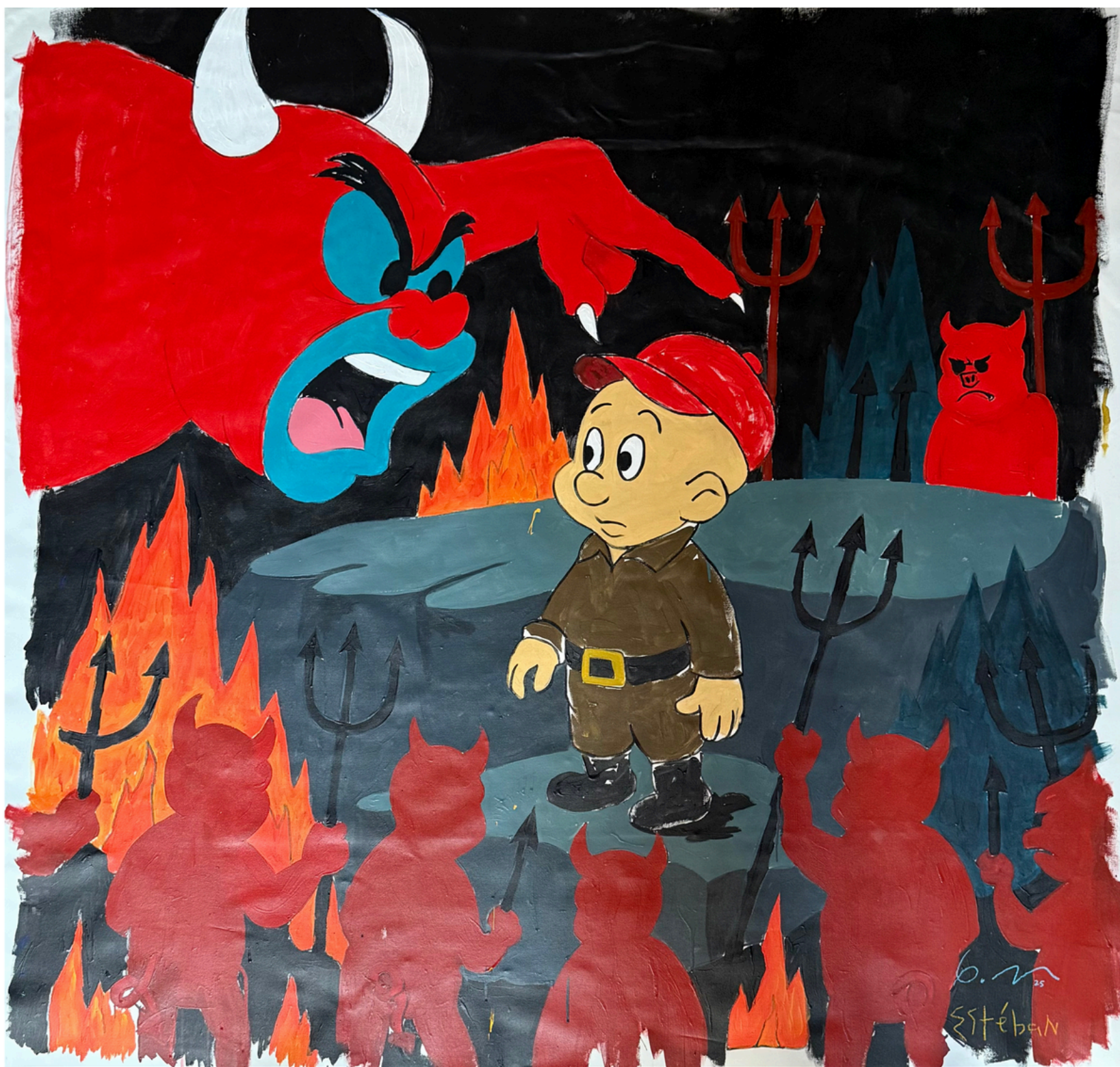
Everyone Talmbout Heaven, Aint Goin' Series: Amerikkka's Looney Acrylic and Oil Stick on Unstretched Canvas Signed on Back 74" x 74" $14,000 2025