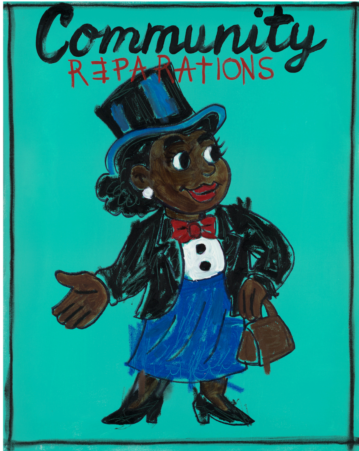
Community Reparations II (2 of 4) Series: The Monopoly of Gentrification Acrylic and Oil Stick on Canvas Signed on Back 24" x 30" $6,000 2025