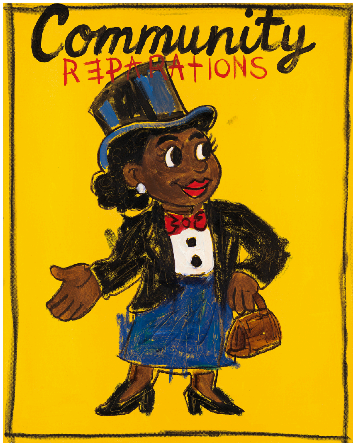
Community Reparations II (4 of 4) Series: The Monopoly of Gentrification Acrylic and Oil Stick on Canvas Signed on Back 24" x 30" $6,000 2025