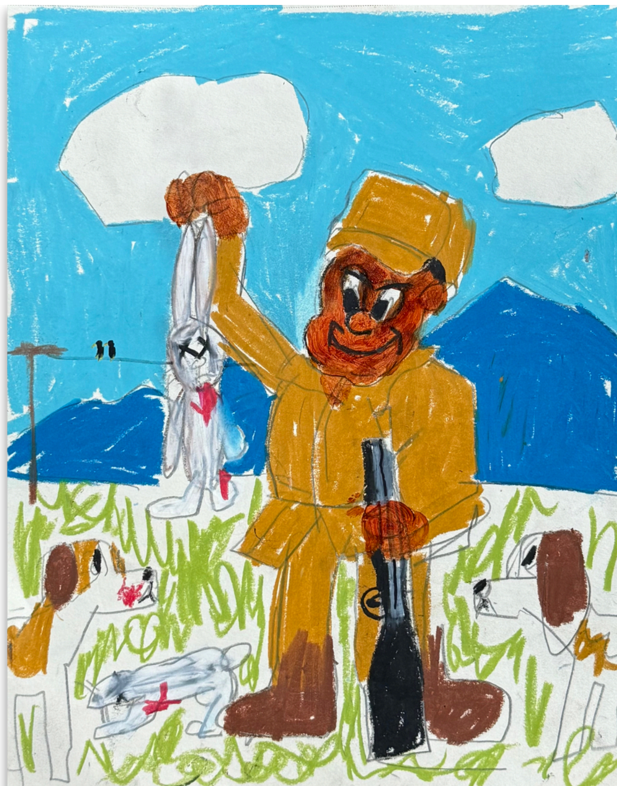
Huntin Wabbits | Concept Sketch/Study Series: Amerikkka's Looney Wax Pastel and Acrylic on Paper Signed on Back 8" x 10.5" $1,250 2025