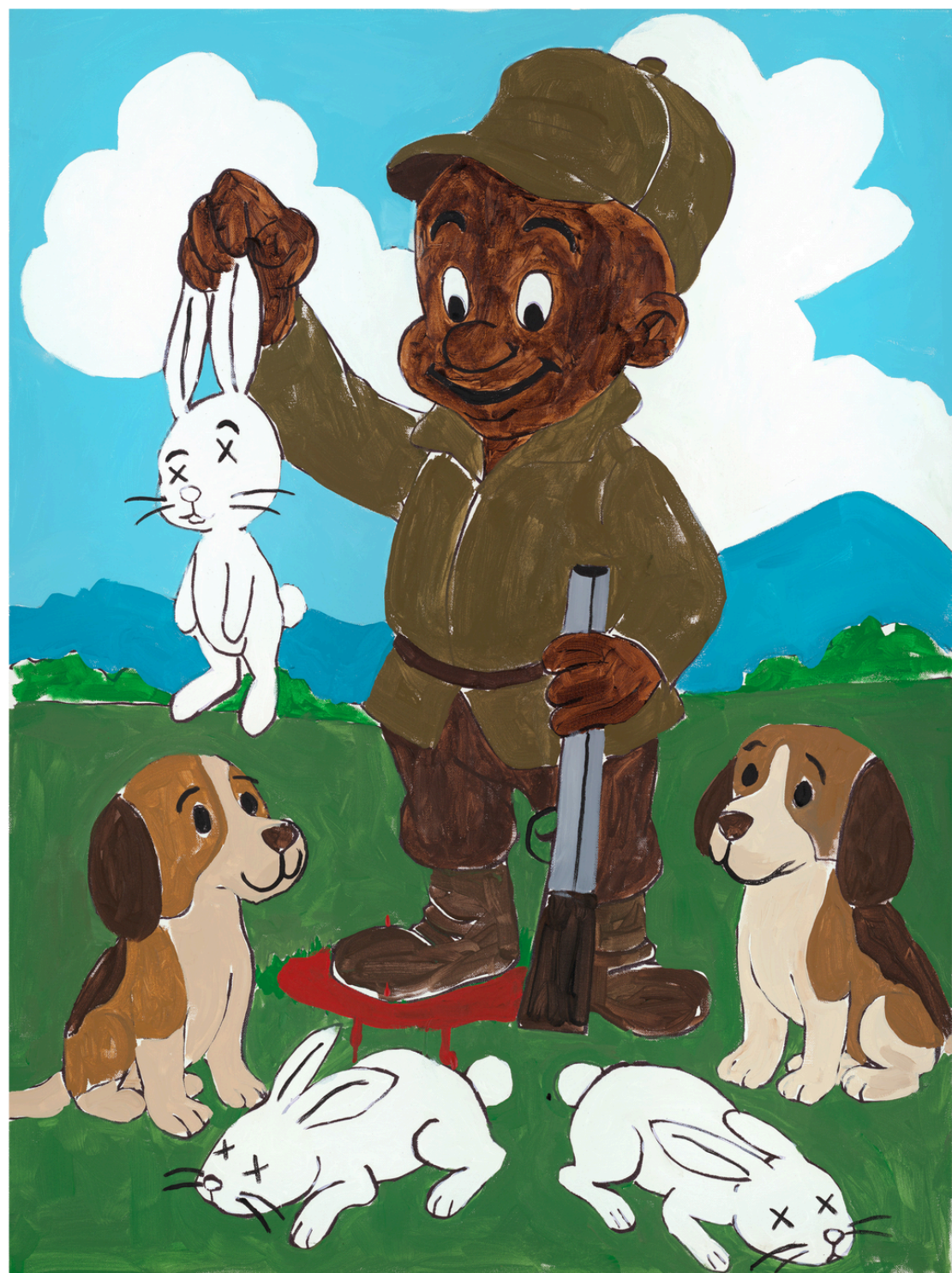
Huntin Wabbits Series: Amerikkka's Looney Acrylic and Oil Stick on Canvas Signed on Back 30" x 40" $7,000 2025