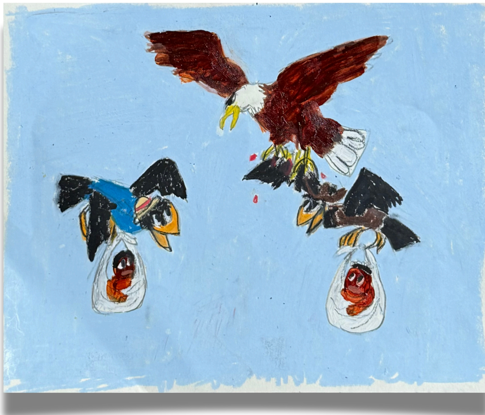
No Fly Zone | Concept Sketch/Study Series: Amerikkka's Looney Wax Pastel and Acrylic on Paper Signed on Back 8" x 10.5" $1,250 2025