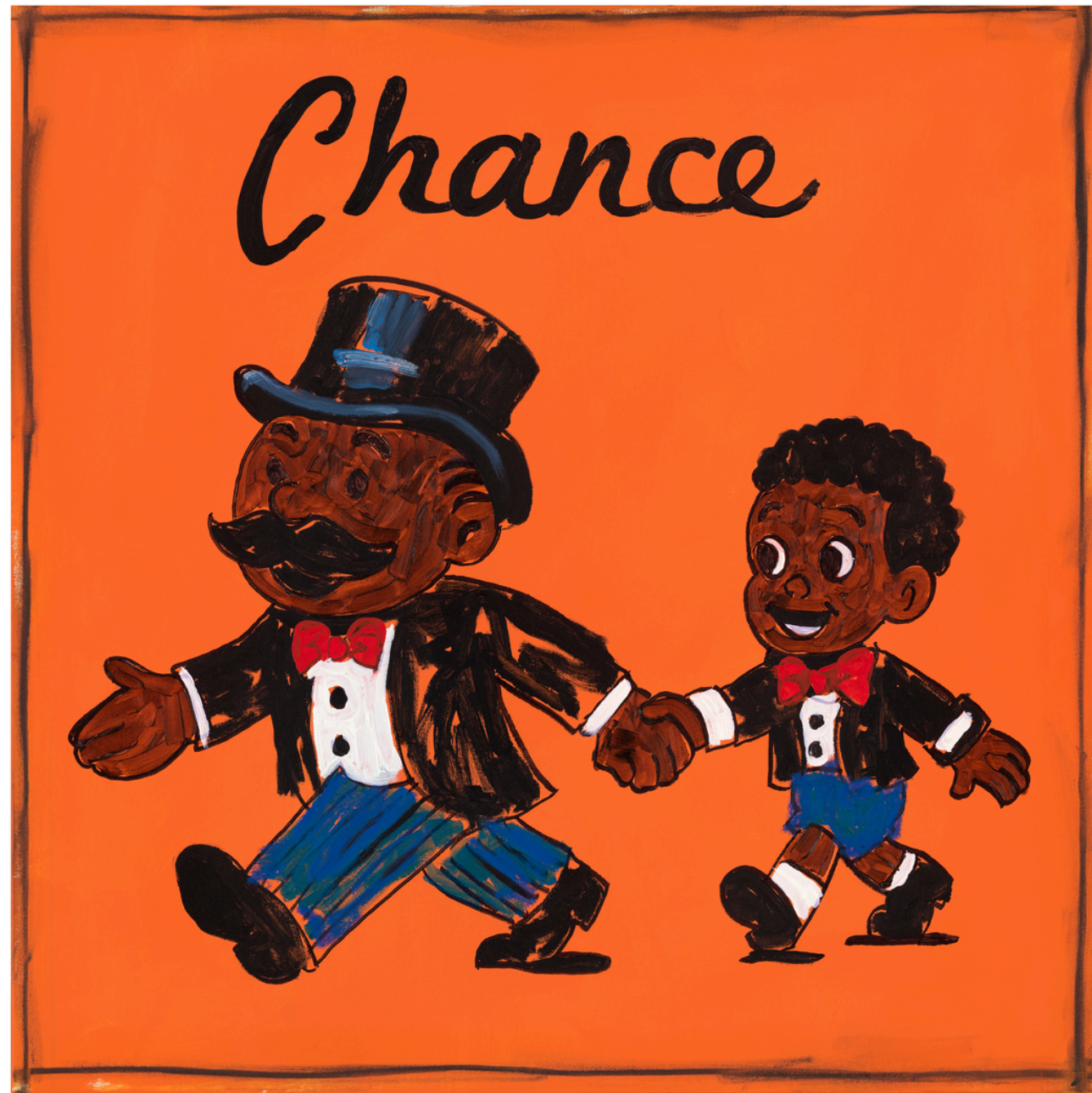
Generational Wealth (1 of 3) Series: The Monopoly of Gentrification Acrylic and Oil Stick on Canvas Signed on Back 36" x 36" $8,000 2025