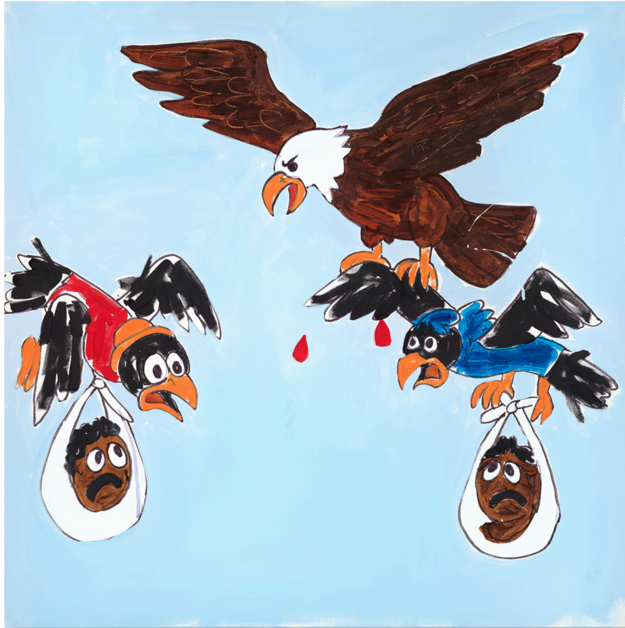
No Fly Zone Series: Amerikkka's Looney Acrylic and Oil Stick on Canvas Signed on Back 36" x 36" $8,000 2025