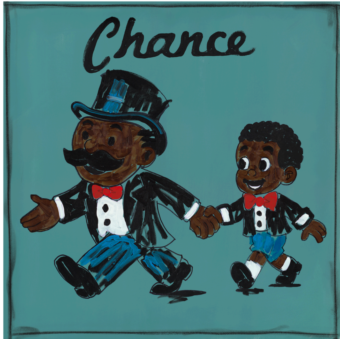
Generational Wealth (2 of 3) Series: The Monopoly of Gentrification Acrylic and Oil Stick on Canvas Signed on Back 36" x 36" $8,000 2025