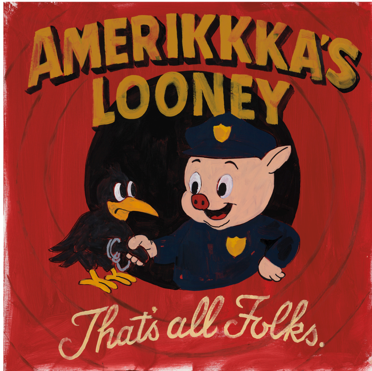
Amerikkka's Looney Series: Amerikkka's Looney Acrylic and Oil Stick on Canvas Signed on Back 36" x 36" $8,000 2025